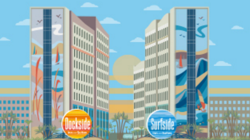
UNIVERSAL'S ENDLESS SUMMER RESORT