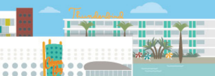
CABANA BAY BEACH RESORT