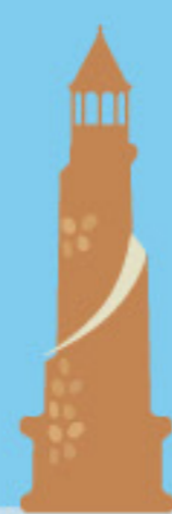
UNIVERSAL'S ISLANDS OF ADVENTURE