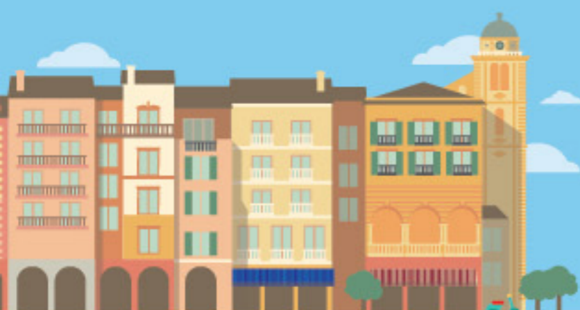
LOEWS PORTOFINO BAY HOTEL