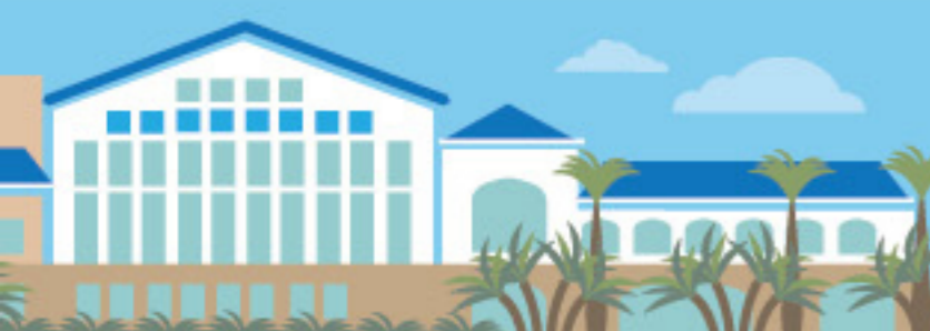
LOEWS SAPPHIRE FALLS RESORT