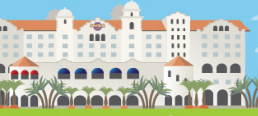
HARD ROCK HOTEL®