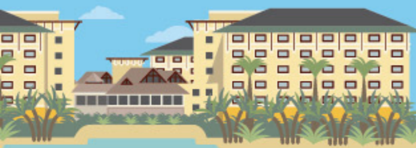
LOEWS ROYAL PACIFIC RESORT