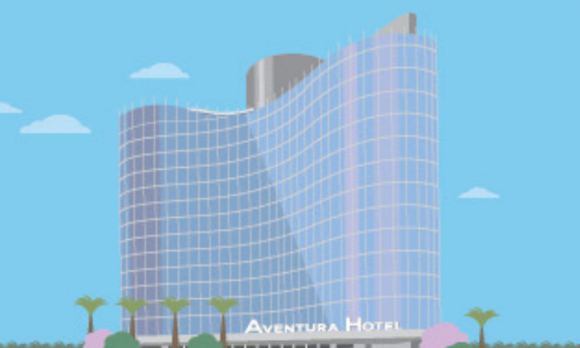
UNIVERSAL'S AVENTURA HOTEL