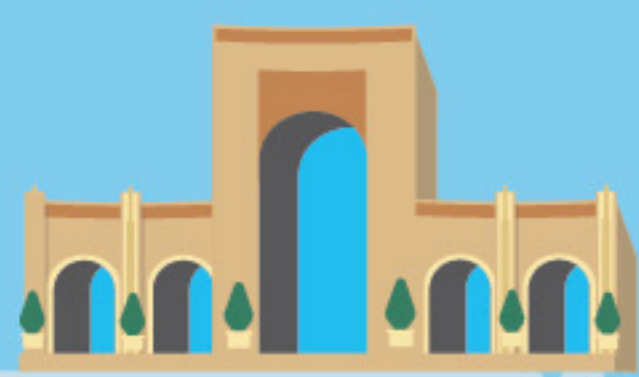
UNIVERSAL STUDIOS FLORIDA